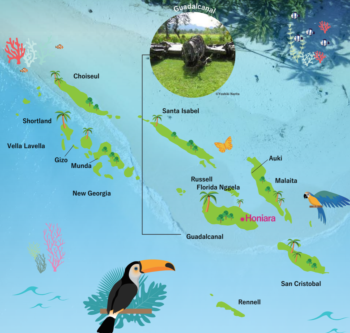
Example of flight routes

The name 'Solomon' comes from a legend that an explorer who found gold in the sands of Guadalcanal- he thought that he found the island of King Solomon, who flourished in ancient times. The sumptuous treasures of King Solomon may not be found in the Solomon Islands today. However, the cultural and natural richness of the Solomon Islands built over time is even greater treasure.