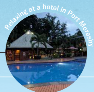
Relaxing at a hotel in Port Moresby

Example of flight routes Narita = Brisbane (Australia) → Port Moresby (Papua New Guinea)