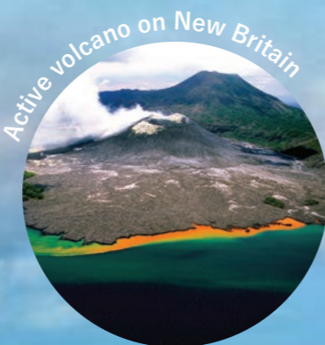
Active volcano on New Britain