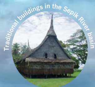
Traditional buildings in the Sepik River basin

Papua New Guinea (PNG) is made up of 600 islands of various sizes and is approximately 1.25 times the size of Japan. With a population of over 10 million, it is one of the largest countries in the Pacific Islands, and with over 800 different languages and ethnic groups with their own customs, new encounters await wherever you go. In the capital, Port Moresby, you can learn about culture and relax in the resorts, while in Kokopo and Rabaul, you can visit war sites and reflect on the history of World War II. If available, attend an event that exposes you to PNG's diverse culture, try one of the world's best trekking trails, or venture into the Sepik River for primitive art. There are new encounters everywhere, and why do not embark on an adventure to PNG?