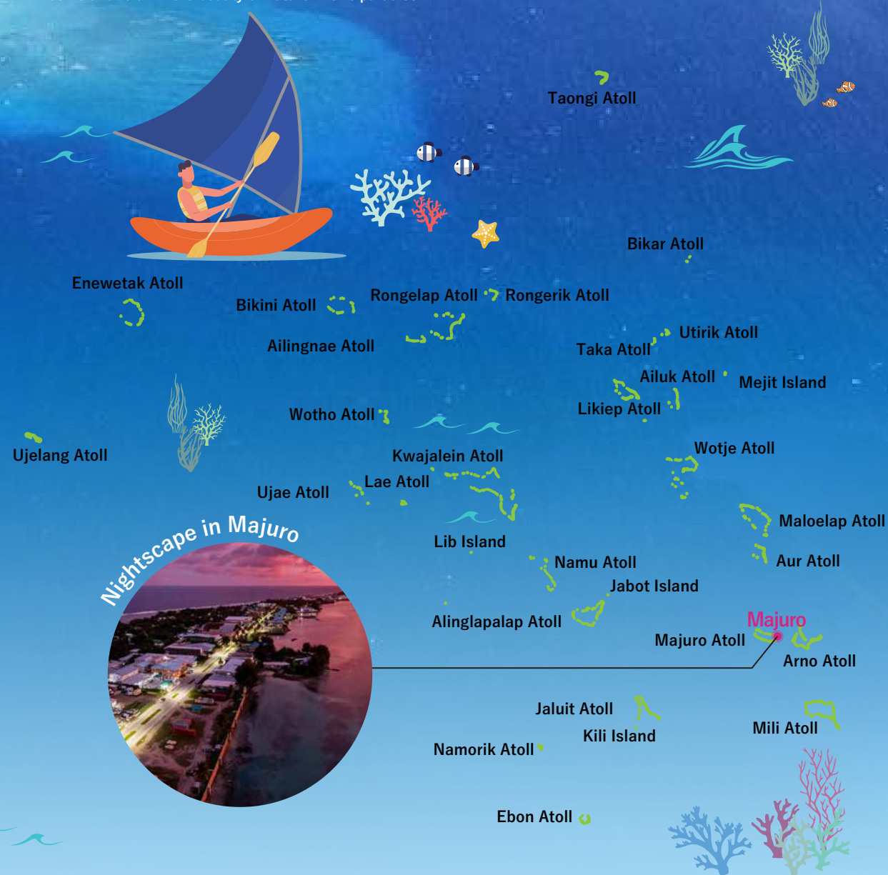
Example of flight routes

Come and relax in the beauty of nature in this paradise.