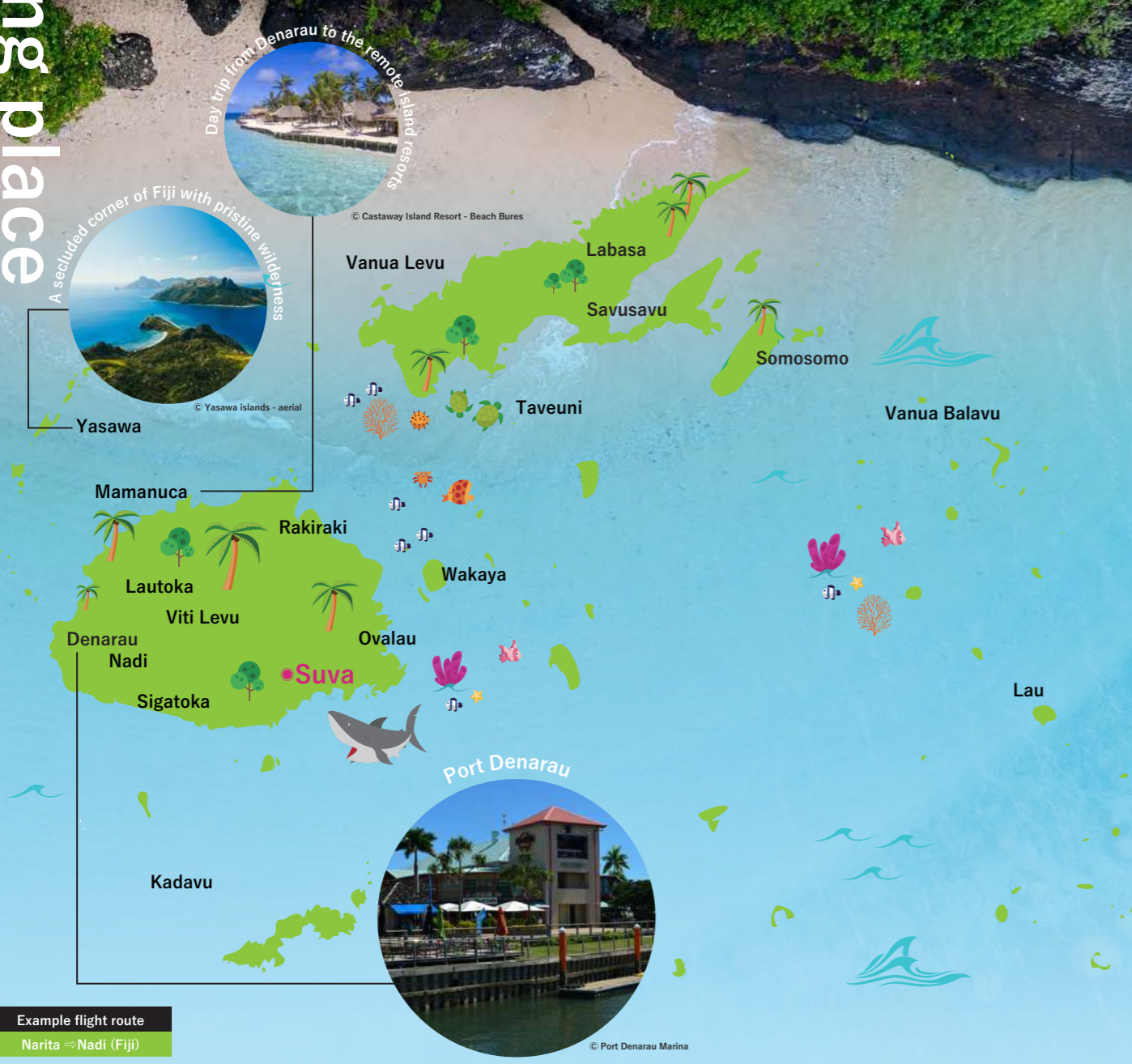
Day trip from Denarau to the remote island resorts

Viti Levu, the main island of Fiji, is located approximately 3100 km northeast of Australia and 2100 km north of New Zealand. The nearest Pacific Island Country, Tonga, is 770 km east, and Vanuatu is 1100 km west. It comprises more than 330 beautiful islands, with a total land area approximately the size of Shikoku in Japan. With crystal-clear waters, coral reefs in the sea, white sandy beaches, and lush vegetation, Fiji satisfies every traveller, from resort-goers to active backpackers. Fiji, besides being rich in natural beauty, is also a multi-ethnic nation with a blend of Melanesian, Polynesian, and Indian cultures. This unique cultural atmosphere gives the country a distinct Fijian charm.